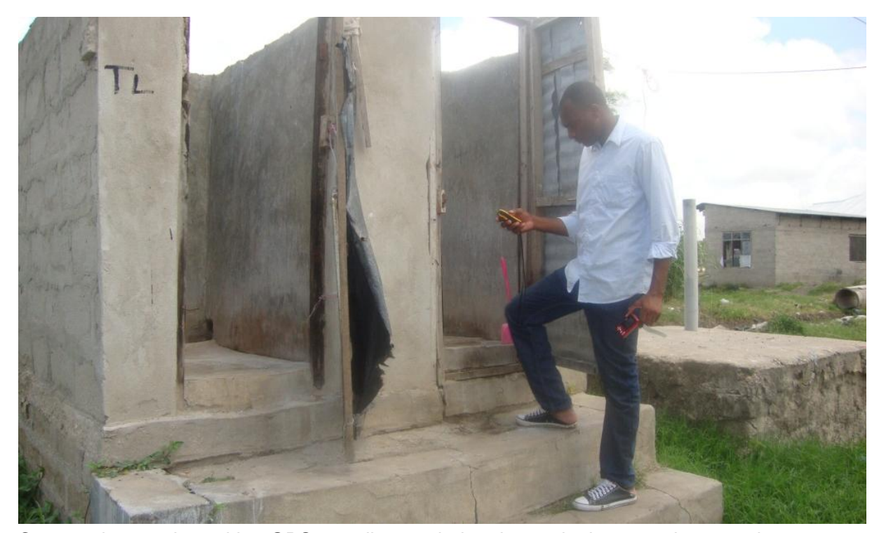
Community member taking GPS coordinates during the sanitation mapping exercise at Kombo settlement.

In its second year this action research project will demonstrate new sanitation precedents. These precedents will exemplify models of sanitation provision that are affordable to low-income households and which have the potential to address the scale of need through replication across the city. The collaboration with local government is intended to maximise the likelihood of leveraging financial resources and the political commitment required for policy and regulatory reform. A partnership between government and organized communities of the urban poor is central in this strategy and the co-production of affordable sanitation solutions is likely to be the most effective way to secure city-wide improvements.