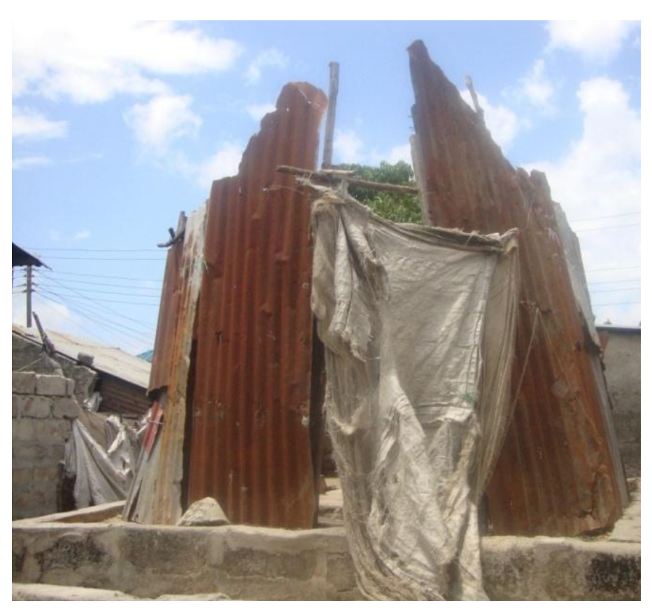
A poorly constructed pit latrine at Kombo settlement. M.Mkanga 2012.

Community mapping towards inclusive development