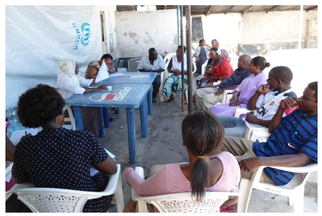
Community members participating in a focus group discussion at Keko Machungwa settlement during the situational analysis study. Shame Juma, 2012.

The processes of profiling, mapping and enumeration included feedback meetings with the communities. Data gathered was shared and community participants were encouraged to respond to the findings and propose solutions to identified problems. The direct engagement of community members in the collection and analysis of data helped communicate the findings to other residents and strengthen the presentation of the results to the local authorities.