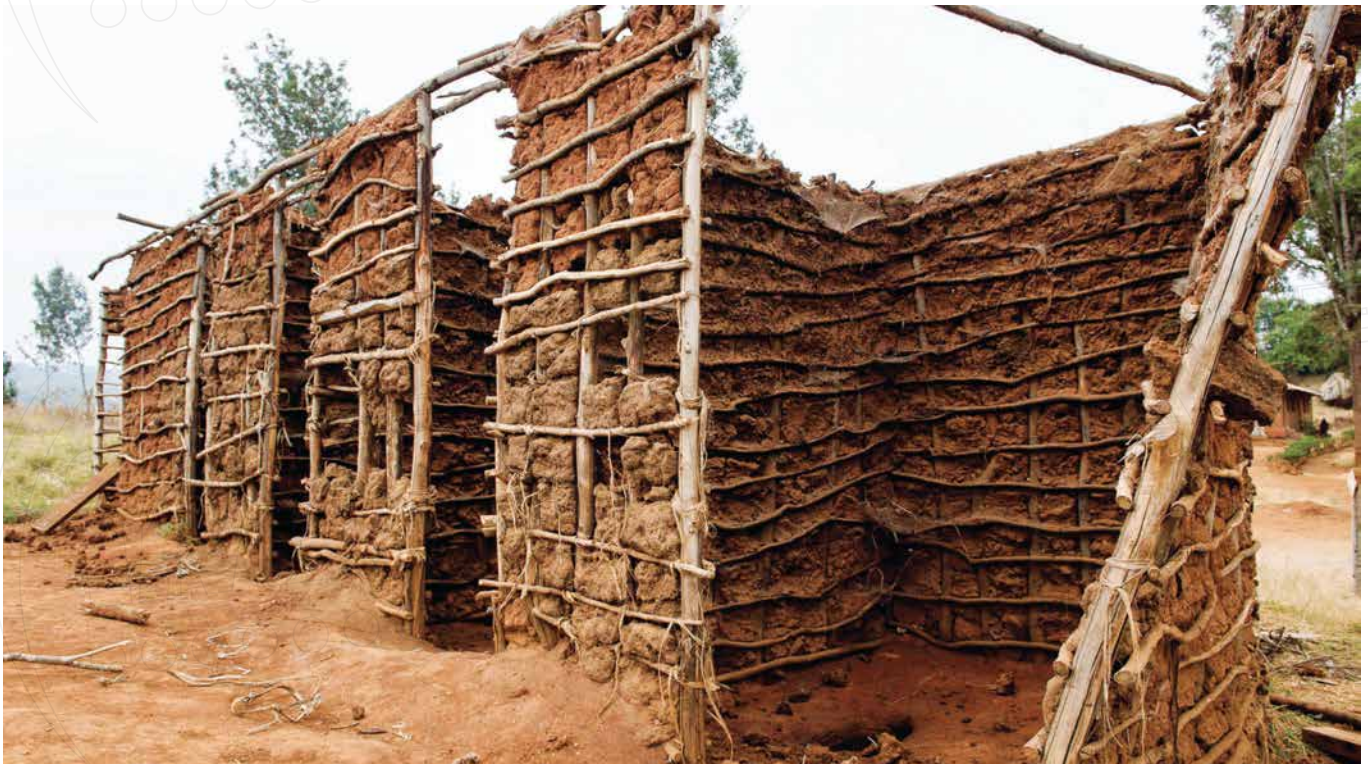
An example of unimproved latrines in Babati Town.