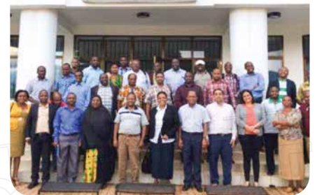
Top photo: one of the solid waste collection sites in Babati town. Bottom photo: stakeholders at the start-up workshop.